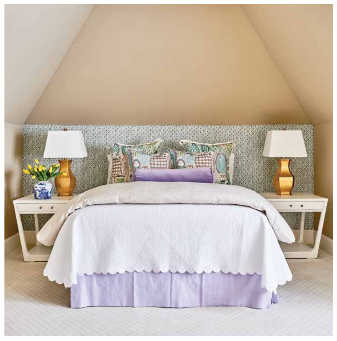
ABOVE: Because of the unusual roofline of the homeowners' daughter's room, the designers opted to add an upholstered wall using an Osborne & Little fabric. The wall acts as a headboard and was custom designed by Zaga Upholstery in Raleigh.

OPPOSITE: The homeowners wanted the master bedroom to feel warm, happy, and colorful, so Dunnigan and Gammons infused the room with color. The custom metal benches at the end of the bed are swathed in a beautiful coral fabric by Brunschwig & Fils. The bed is by Oly Studio.