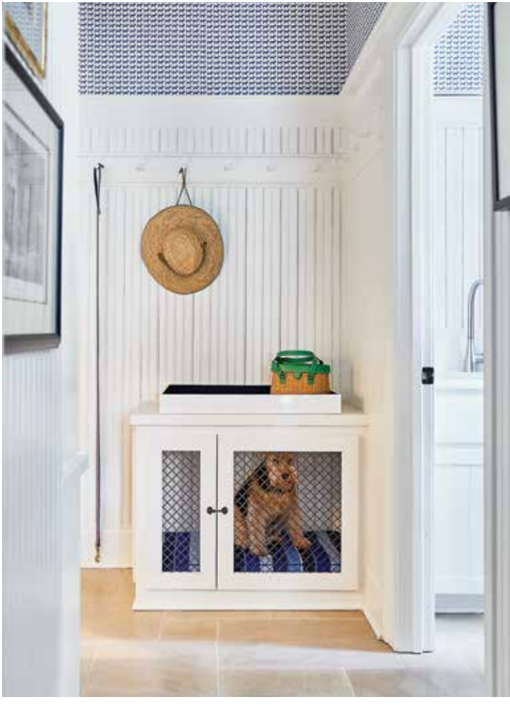
ABOVE : To create a playful, casual side entry to the home, the designers added an Anna French wallpaper, which features a tiny dog-print pattern. The designers complemented the wallpaper with vertical tongue-and-groove, which gives the utility space a tailored look.

OPPOSITE: The homeowners' collection of blue-and-white pottery informed the design of the living room, which boasts a bold color palette of greens and blues. The Osborne & Little fabric on the draperies coupled with the custom rug from Stanton establish the blue accents, while the pair of custom green velvet swivel chairs provide an additional pop of color.